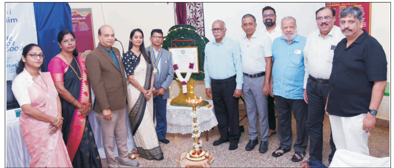
Charter Members pose for a Group Photo along with President, Secretary, First Lady and the Invited Guests