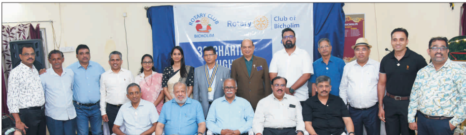
Charter Members and Past Presidents of Rotary Club of Bicholim who served the Club with distinction pose for a Group Photo with Invited Guests