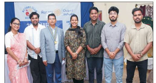
Charter Night was attended by the members of Rotaract Club of Bicholim who pose for a Group Photo with President and Secretary